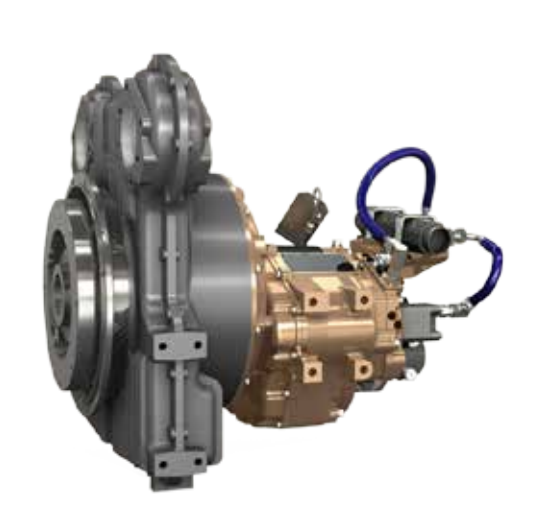
MPD22 with marine gear box

Input & Output side ready for any SAE standard transmission