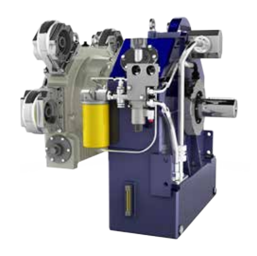
MPD18 with Variable Fill Fluid Coupling