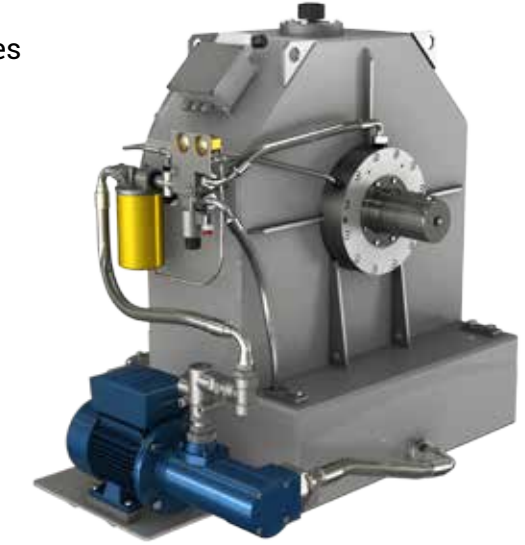
Monitorable and controllable by a dedicated Microprocessor MPCB R5 (*)