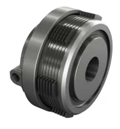
SHC - Hydraulic Clutches

Integrated in Water Jet Propulsion System for propeller disengagement and reverse for grid debris cleaning